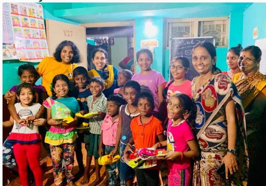
This event was covered by The Hindu Downtown: Sep 08, RMT residents contribute stationery kit to poor students

"What a blessing it was to be part of the event today with the little ones. It was a completely heartening and satisfying experience to see the smiles on the kids' faces. For our children to see others like them, but at a different spectrum of life - no amount of teaching or telling can help them understand it better than experience it, like today. Heartfelt thanks to you and your team for all your efforts 😊😊"