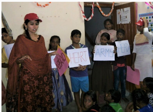
This event was covered by The Hindu : Sep 06, OUP employees take over education centres for an evening